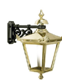
Item 04 01no Large Brass Victorian lantern. Size: 480mm x 630mm Scale: NTS