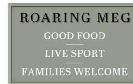
Item 03 01no Bullnose Fascia board with individual house name letters, applied vinyl secondary text. Size: Site Specific Scale: NTS