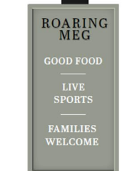
Item 07 01no New double sided Pictorial with existing gibbet and boot. Externally illuminated via LED trough lights. 02no Amenity boards fitted back to back to existing post. Size: TBC Scale: 1:10