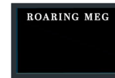
Item 06 01no Lockable poster cases. Size: A0 Scale: NTS