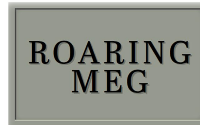
Item 01 01no Bullnose Fascia board with individual house name letters, applied vinyl secondary text. Size: Site Specific Scale: NTS