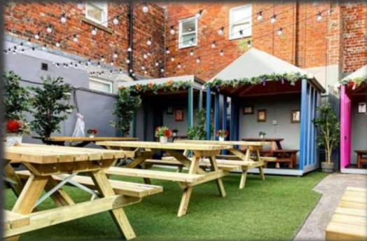
COVERED TIMBER PERGOLA STRUCTURE