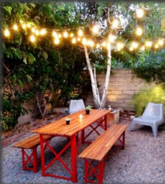
BENCHES / LOOSE SEATING