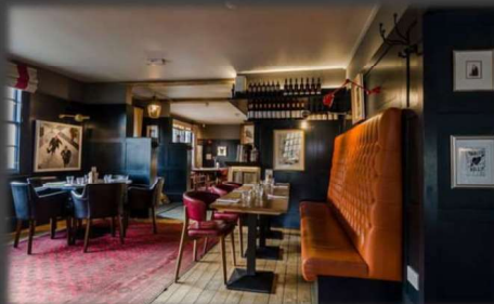
BAR LOUNGE / BAR SNUG