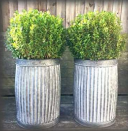
PLANTING POTS / TROUGHS