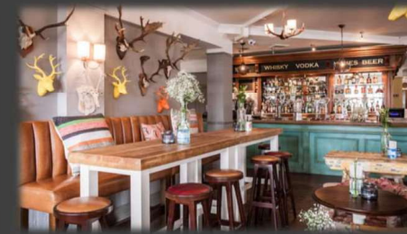
CROSS KEYS CANTERBURY - PUB