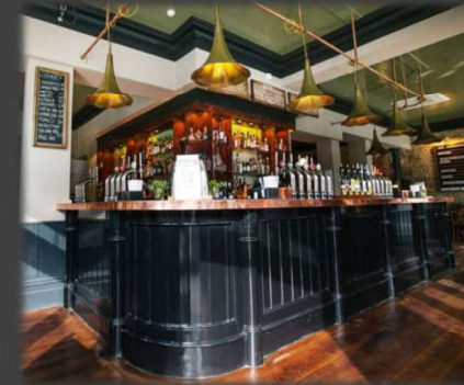
BAR - STANDING/GATHERING