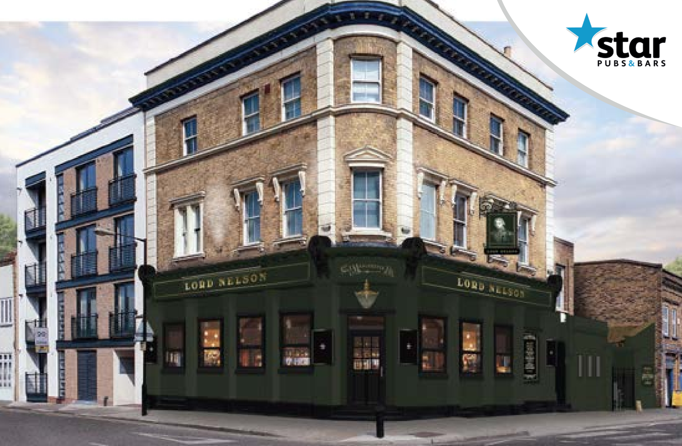
● THE LORD NELSON, 1 MANCHESTER ROAD, LONDON, E14 3BD ●