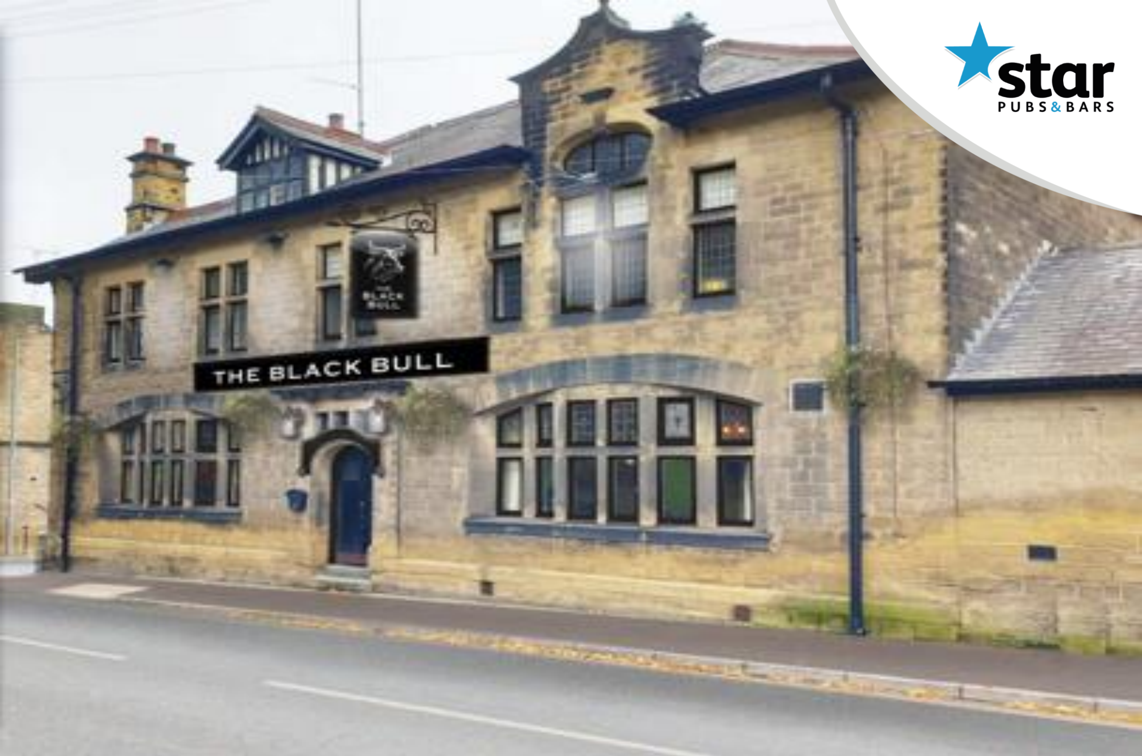
● The Black Bull, 18 Church Street, Sheffield, S35 9WE ●