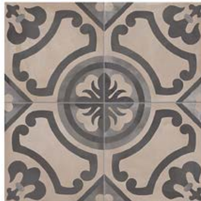
NEW FLOOR TILE TO LADIES