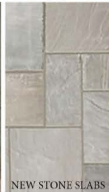
NEW STONE SLABS