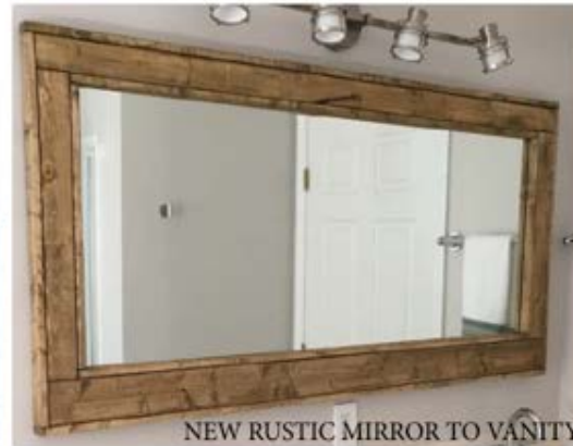
NEW RUSTIC MIRROR TO VANITY