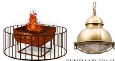
PENDANT TO HUT