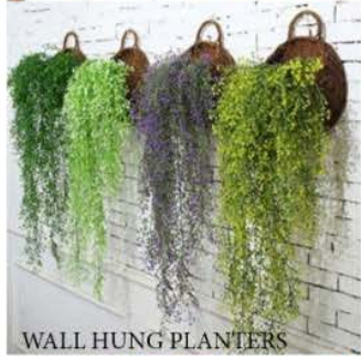
WALL HUNG PLANTERS