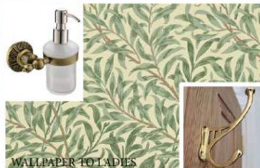
WALLPAPER TO LADIES