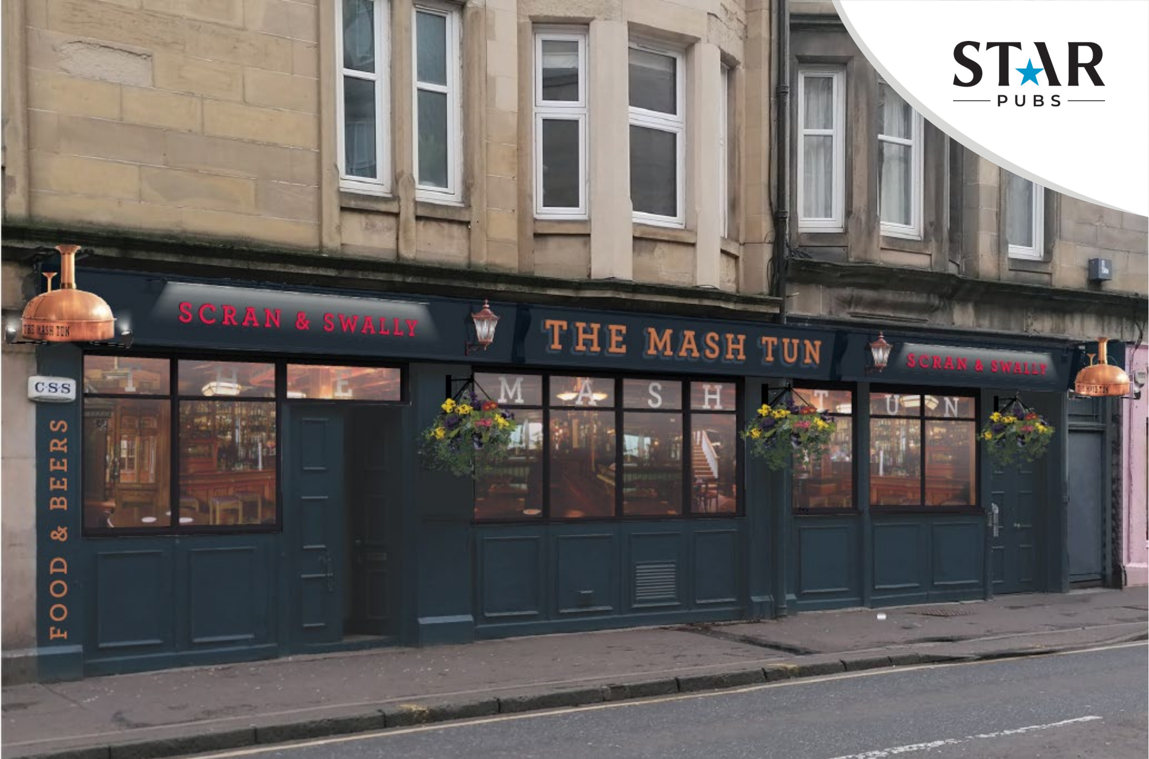
● The Mash Tun, 154-58 Easter Road, Edinburgh, EH7 5RL ●