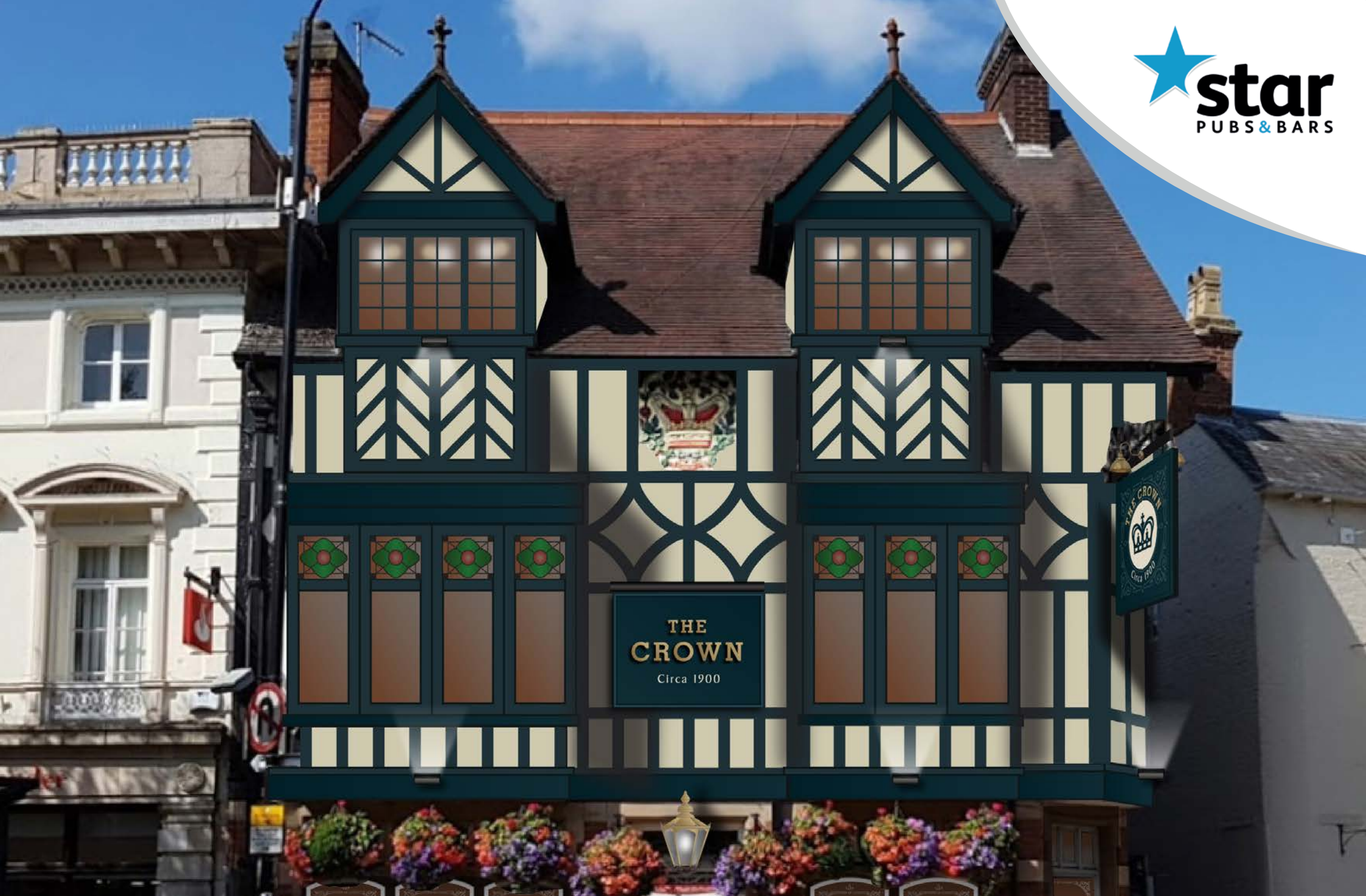
● THE CROWN, 25 MARKET PLACE, RUGBY, CV21 3DU ●