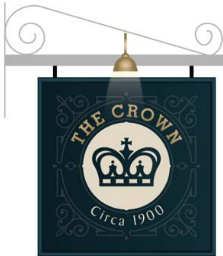
ITEM 1. (1 off) New fabricated pictorial sign with bullnose moulding and vinyl display. Illuminated by a pair of brass cowl lamps. All fitted to the existing gibbet.