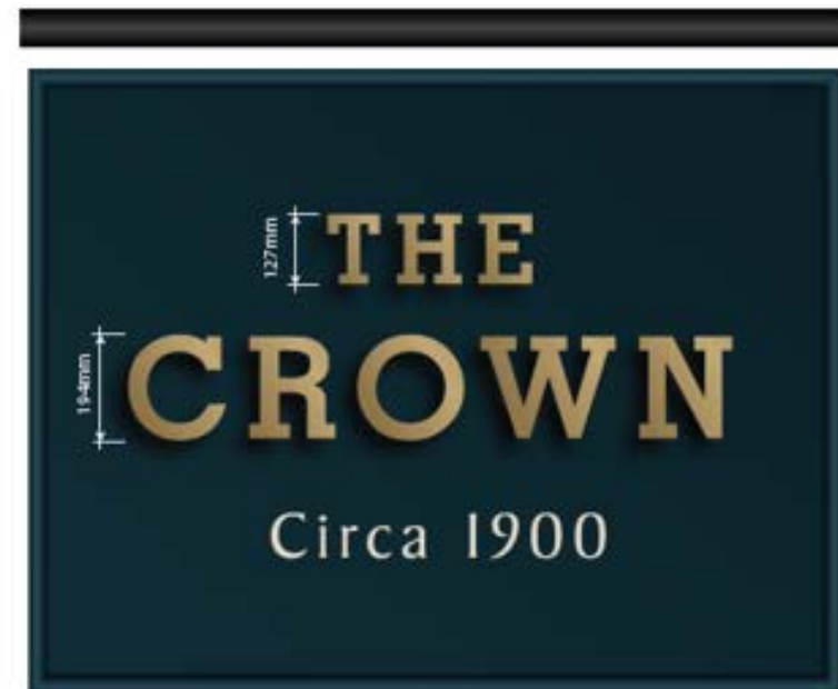
ITEM 2. (2 off) New fascia to match DULUX 708G 07/086 with individual brass letters. 'CIRCA 1900' in cream vinyl. Illuminated by an LED trough light above.