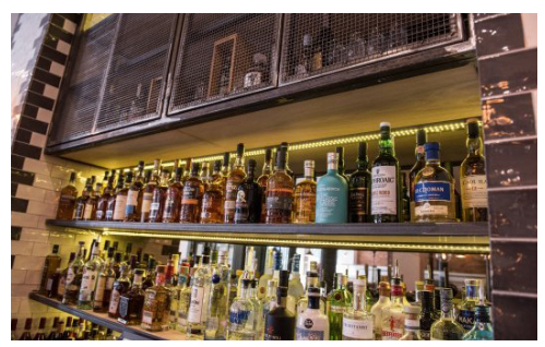
Visuals are for illustrative purposes only. Schemes may vary post completion.