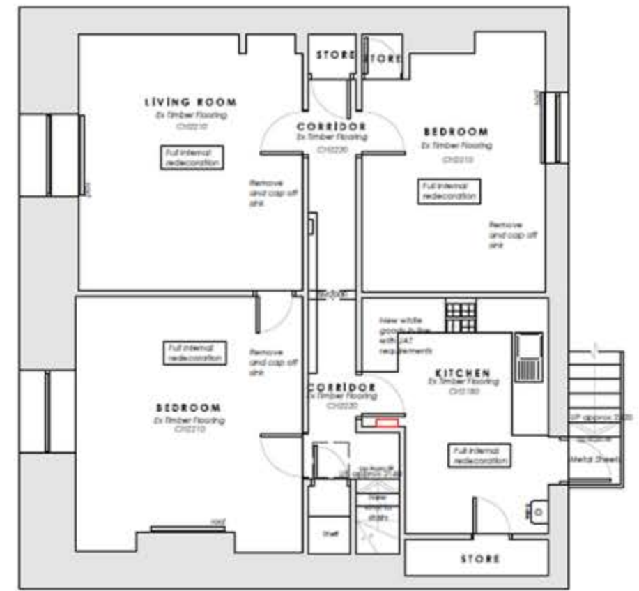
SECOND FLOOR PLAN AS PROPOSED SCALE 0 1m 2m 3m 4m 5m