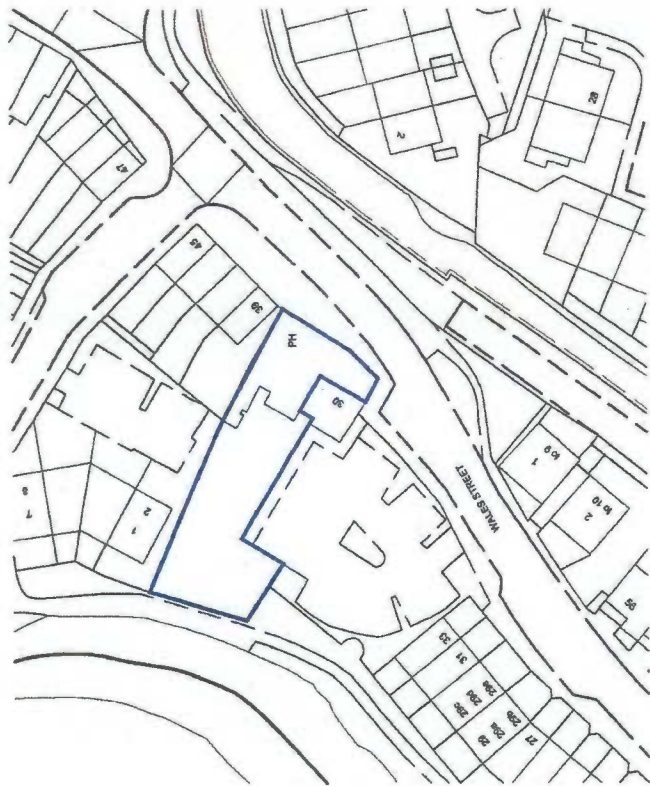
Block Plan 1:500 @A2