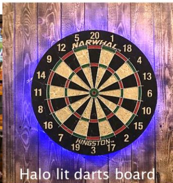
Halo lit darts board