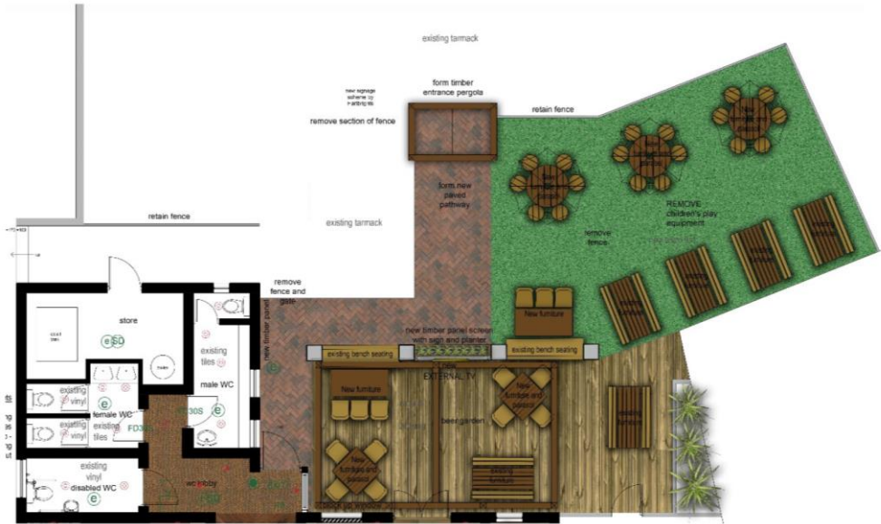
REAR BEER GARDEN