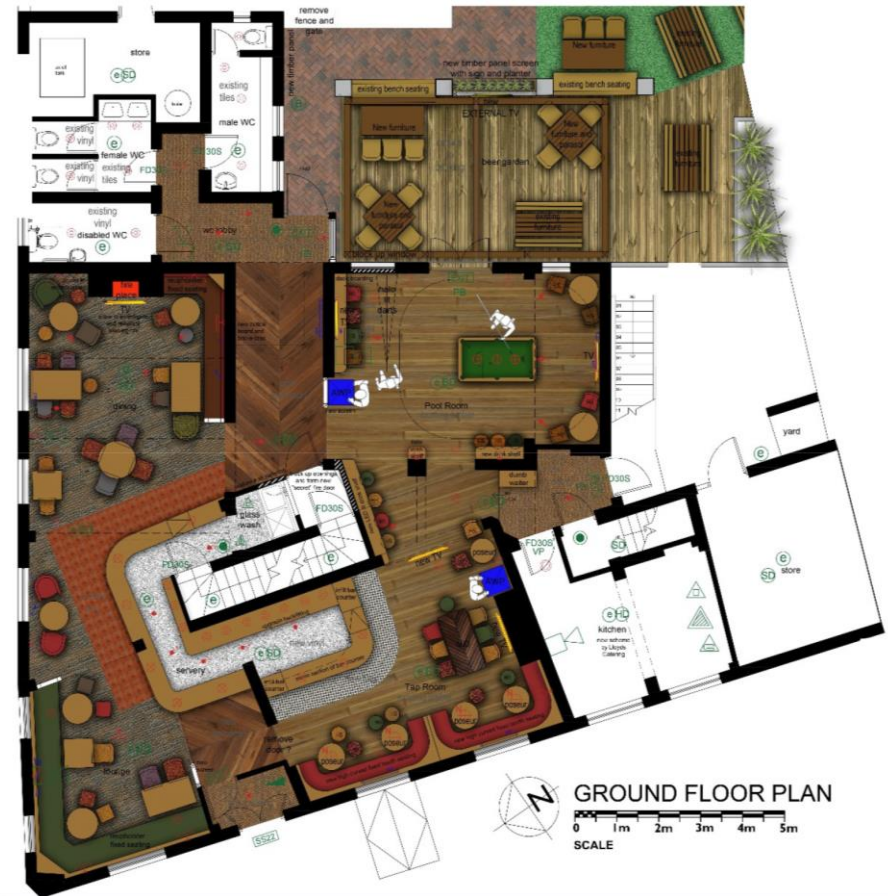
GROUND FLOOR PLAN SCALE