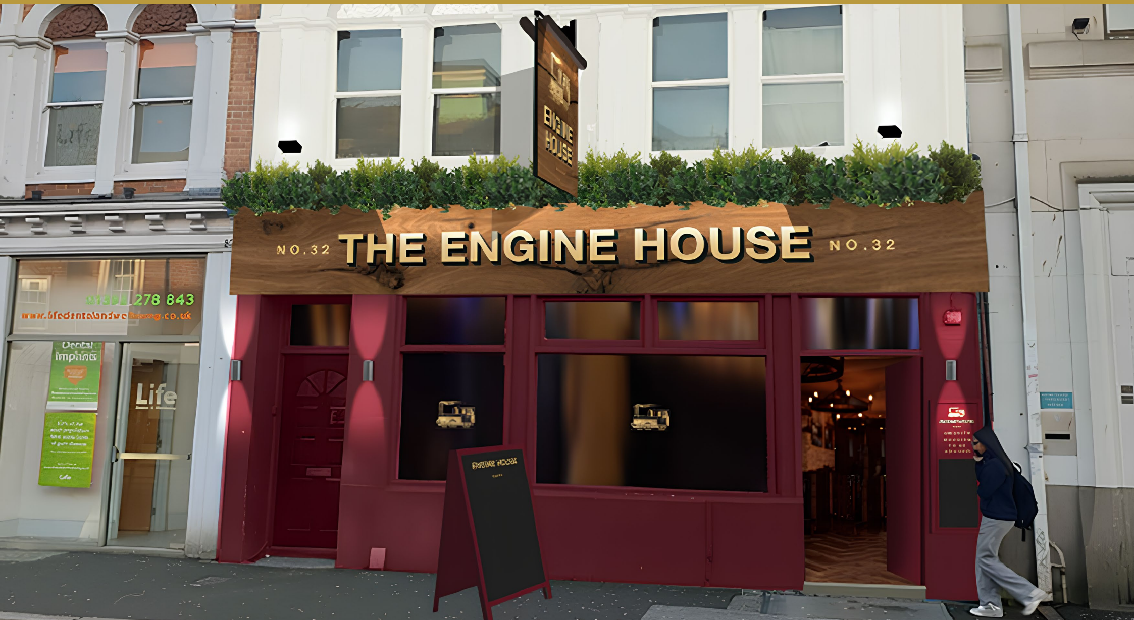
The Engine House, 32 Queen Street, Exeter, EX4 3SR