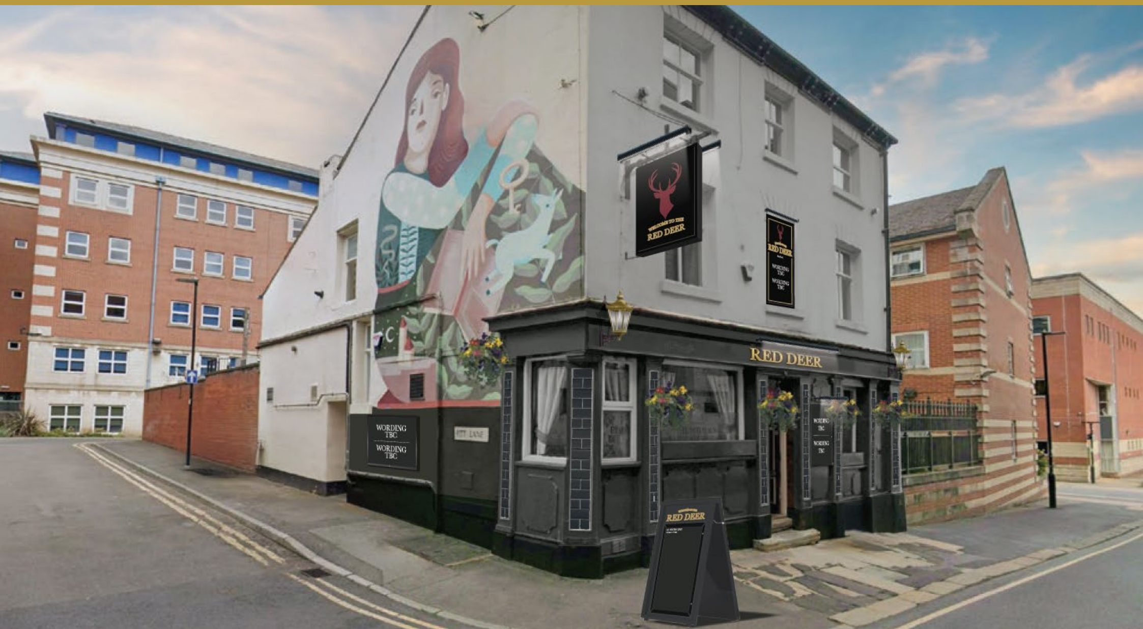
Red Deer, 18 Pitt Street, Sheffield, S1 4DD