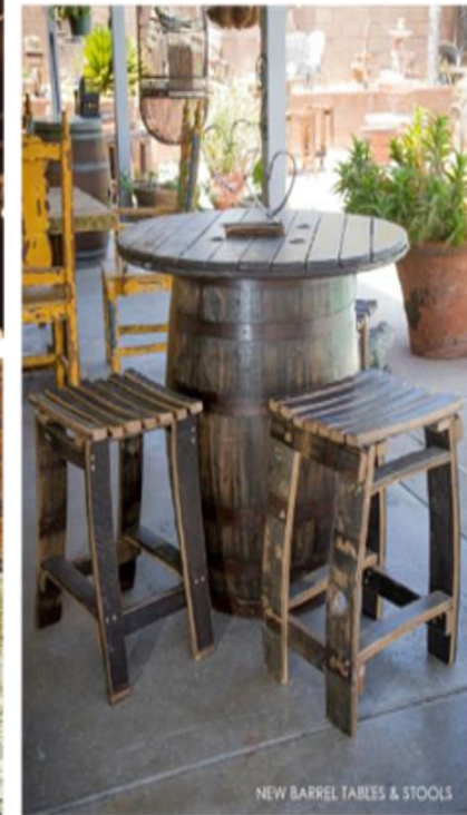
NEW BARREL TABLES & STOOLS