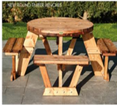
NEW ROUND TIMBER BENCHES