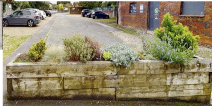
EXISTING TIMBER PLANTER, NEW PLANTING