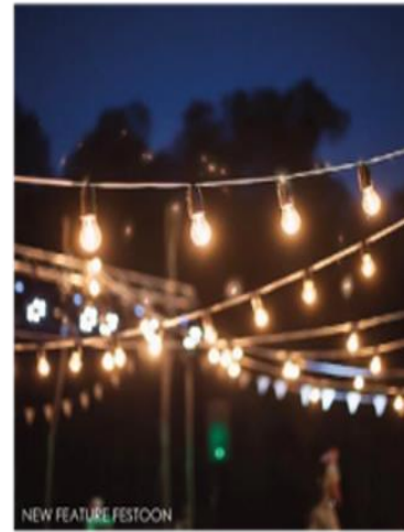
NEW FEATURE FESTOON