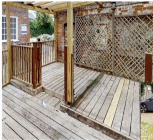
RETAIN TIMBER SHELTER, REPAIR & RESTAIN DECKING