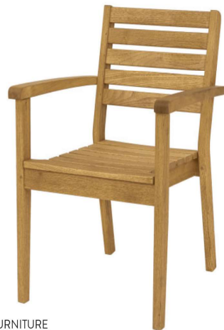
NEW LOOSE FURNITURE