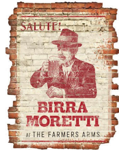
STAR FIRST BRANDING MURAL