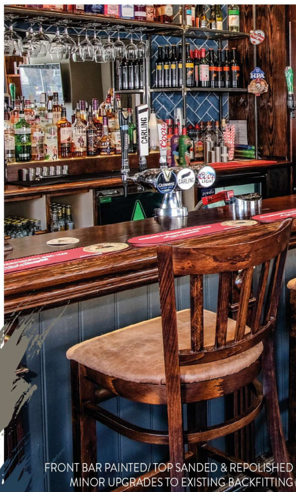
FRONT BAR PAINTED/ TOP SANDED & REPOLISHED MINOR UPGRADES TO EXISTING BACKFITTING