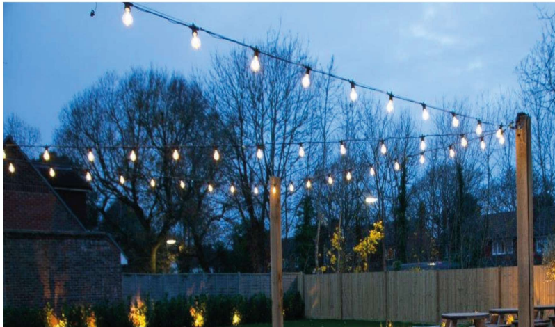
TIMBER POSTS WITH FESTOON LIGHTING