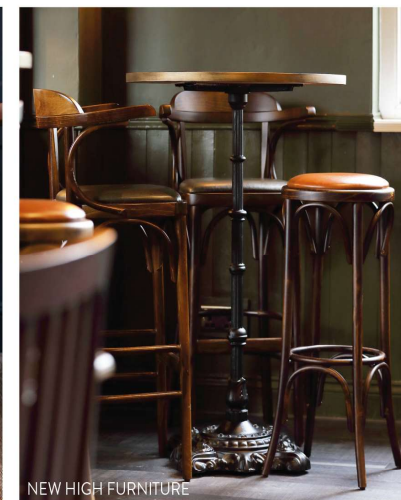
NEW HIGH FURNITURE