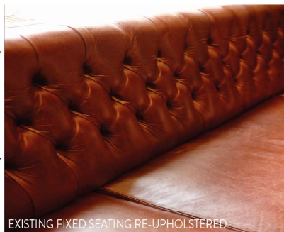
EXISTING FIXED SEATING RE-UPHOLSTERED