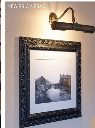
NEW BRIC A BRAC