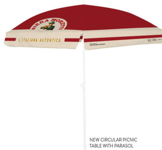
NEW CIRCULAR PICNIC TABLE WITH PARASOL