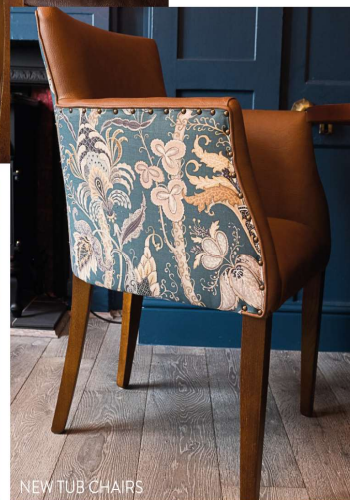
NEW TUB CHAIRS