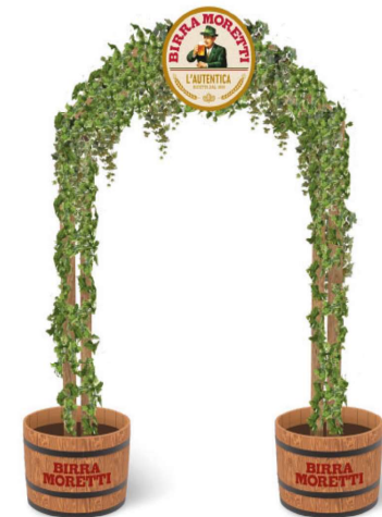
STAR FIRST BRANDING ARCHWAY