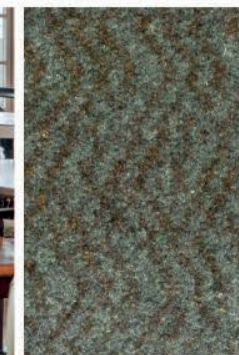
new carpet + existing timber re-finished