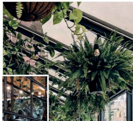
new rustic white wash timber cladding, pendants + metal/mesh planting screens