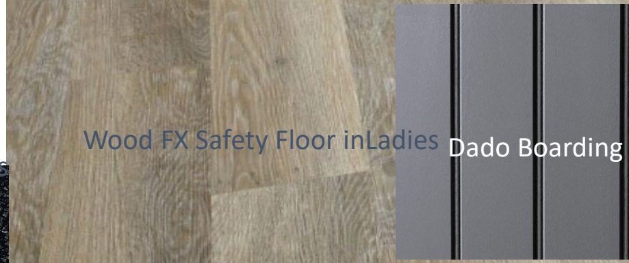
Wood FX Safety Floor in Ladies Dado Boarding