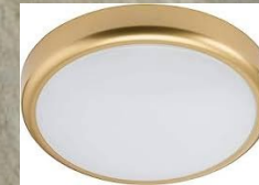
New Bulkhead Light Fittings