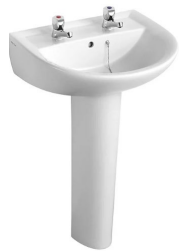
New Pedestal & Urinals in Gents