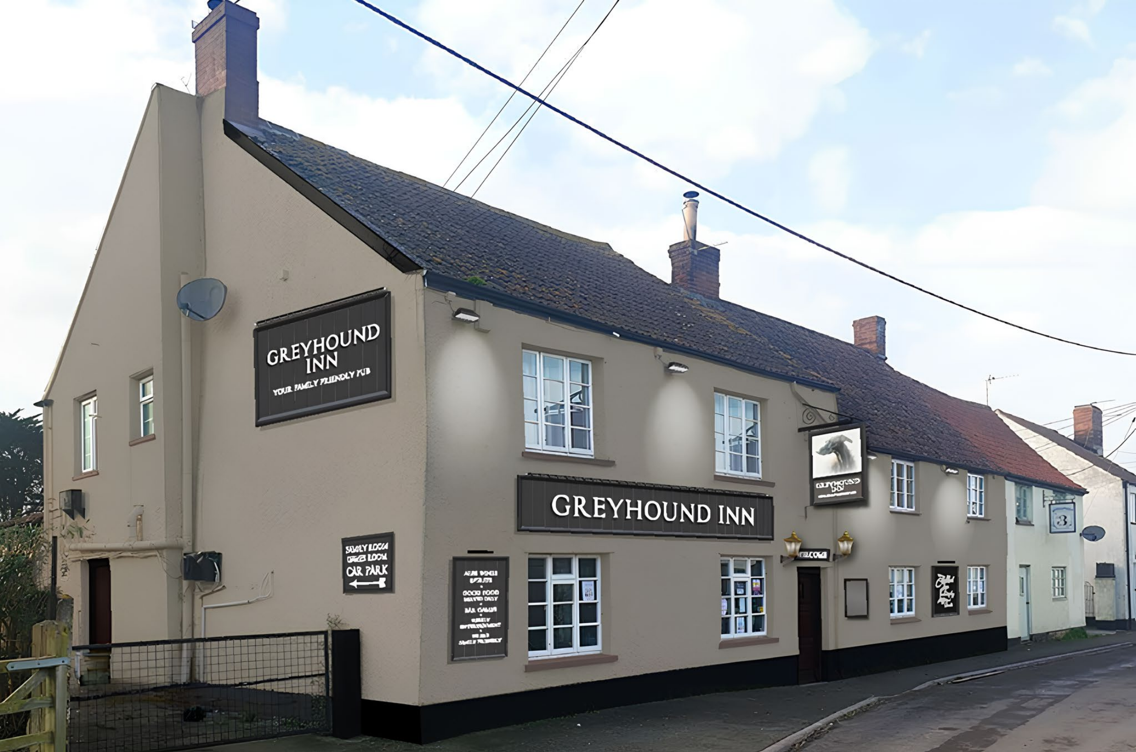
● The Greyhound Inn, 1 Lime Street, Bridgwater, TA5 1QR ●