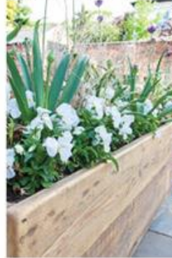
FRONT PLANTER BOXES