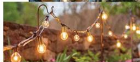
LIGHT UP / FORM PATHWAY.