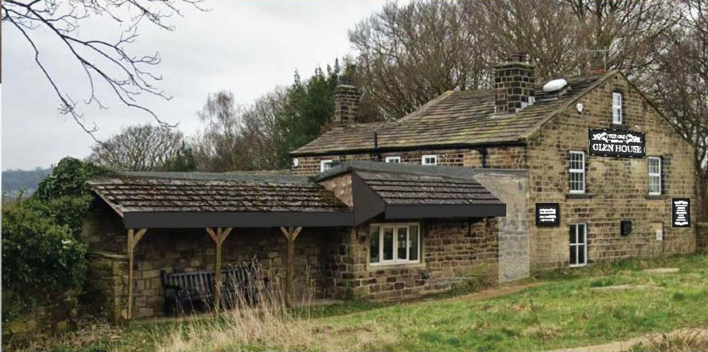
The Old Glen House, Prod Lane, Baildon, BD17 5BN