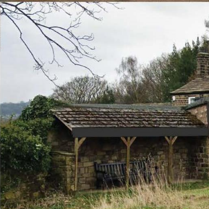
The Old Glen House, Prod Lane. Shipley, BD17 5BN