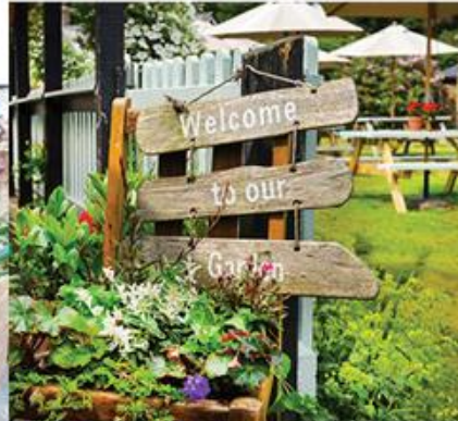
BRIC'A BRAC TO OUTSIDE GARDEN AREA.