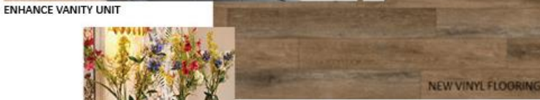
NEW VINYL FLOORING