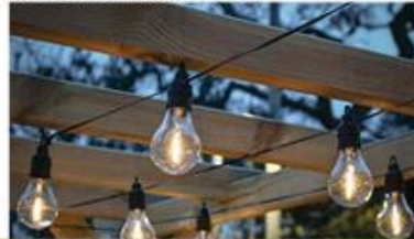
FESTOON LIGHTING TO PERGOLA