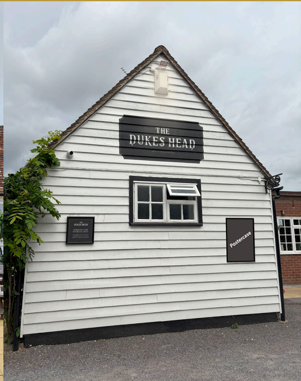
The Dukes Head, London Road, Sevenoaks, TN13 2UR