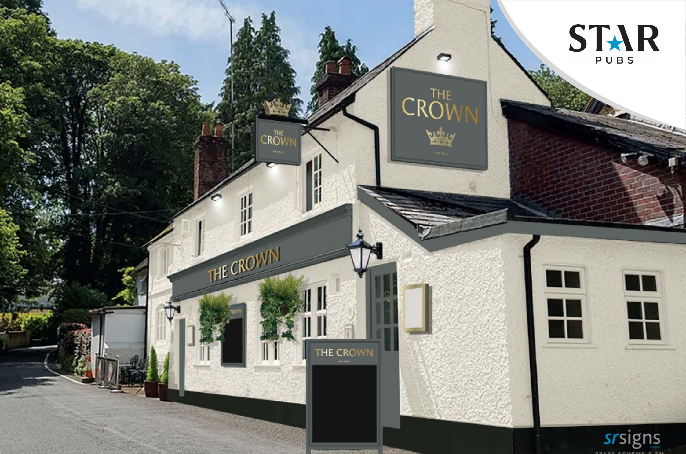
The Crown, Arford Road, Headley, GU35 8BT