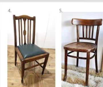
1940s Dining chairs in a mixture of styles