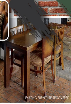
EXISTING FURNITURE RECOVERED