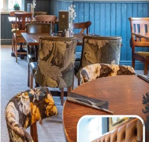
EXISTING T&G REDECORATED