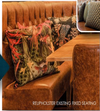
REUPHOLSTER EXISTING FIXED SEATING