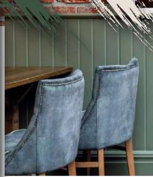
EXISTING FIXED SEATING REUPHOLSTERED