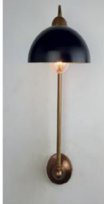
NEW FEATURE LIGHTING