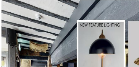
NEW FEATURE LIGHTING