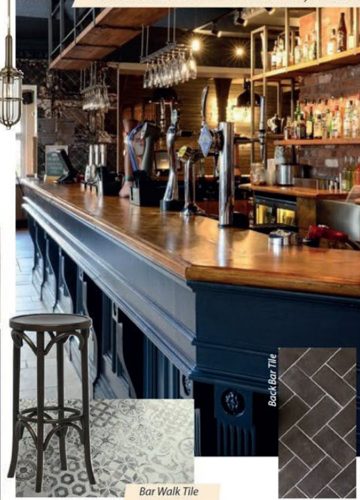
Bar Walk Tile