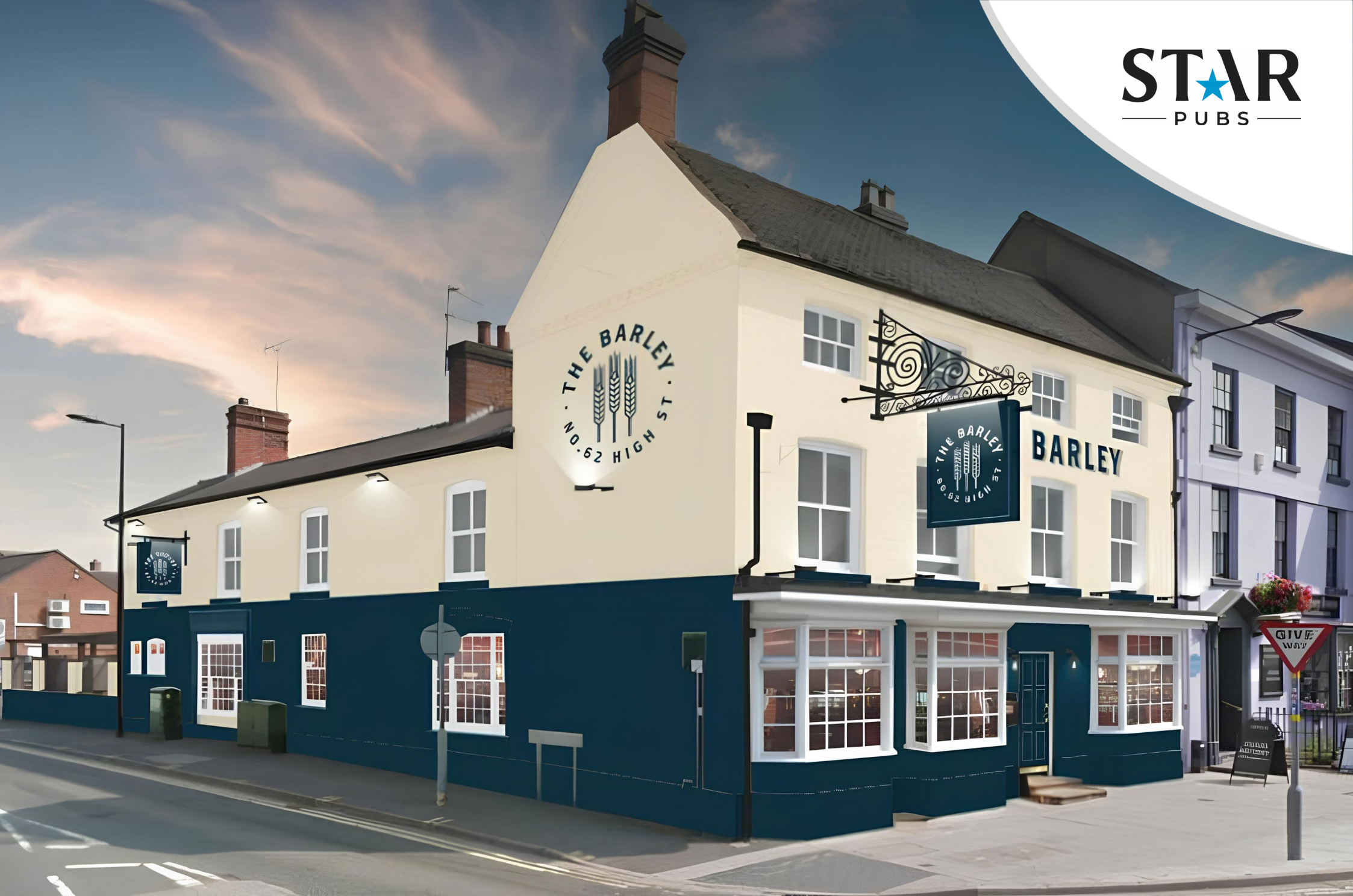
● The Barley, High Street, Newport, Shropshire, TF10 7AQ ●