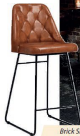
Brick Slip Walls & Furniture Style