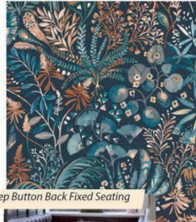
Deep Button Back Fixed Seating