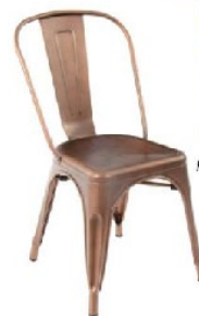
Robust Loose Furniture