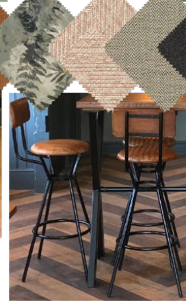
NEW HIGH FURNITURE