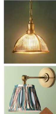
NEW LIGHT FITTINGS