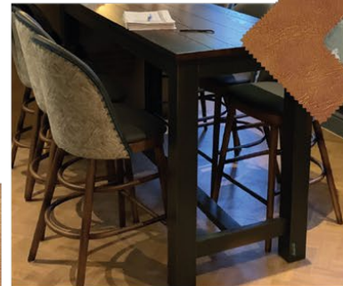
NEW MID HEIGHT FURNITURE