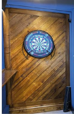
TIMBER EFFECT VINYL