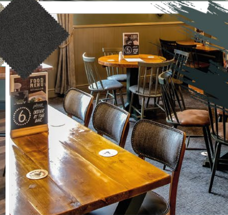
PART NEW DINING FURNITURE