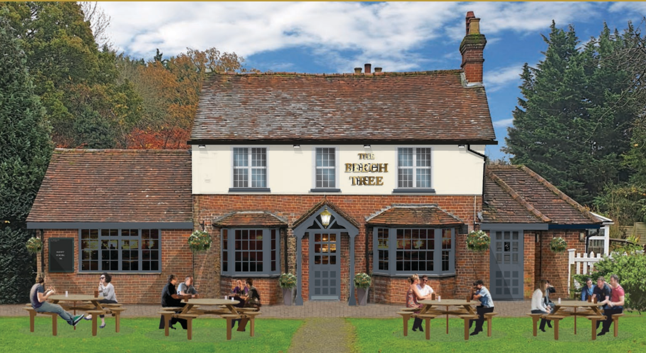
The Beech Tree, Amersham Road, High Wycombe, HP13 5AJ