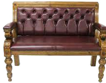
Traditional style seating throughout