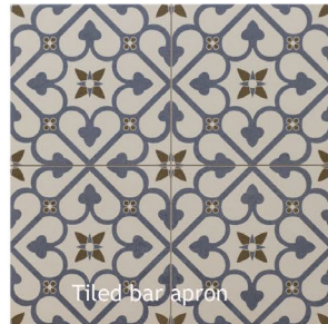
Tiled bar apron