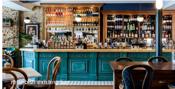
refurbish existing bar