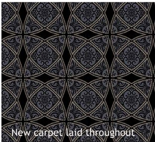
New carpet laid throughout