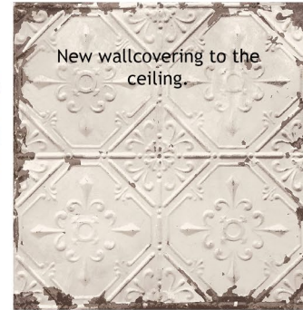
New wallcovering to the ceiling.