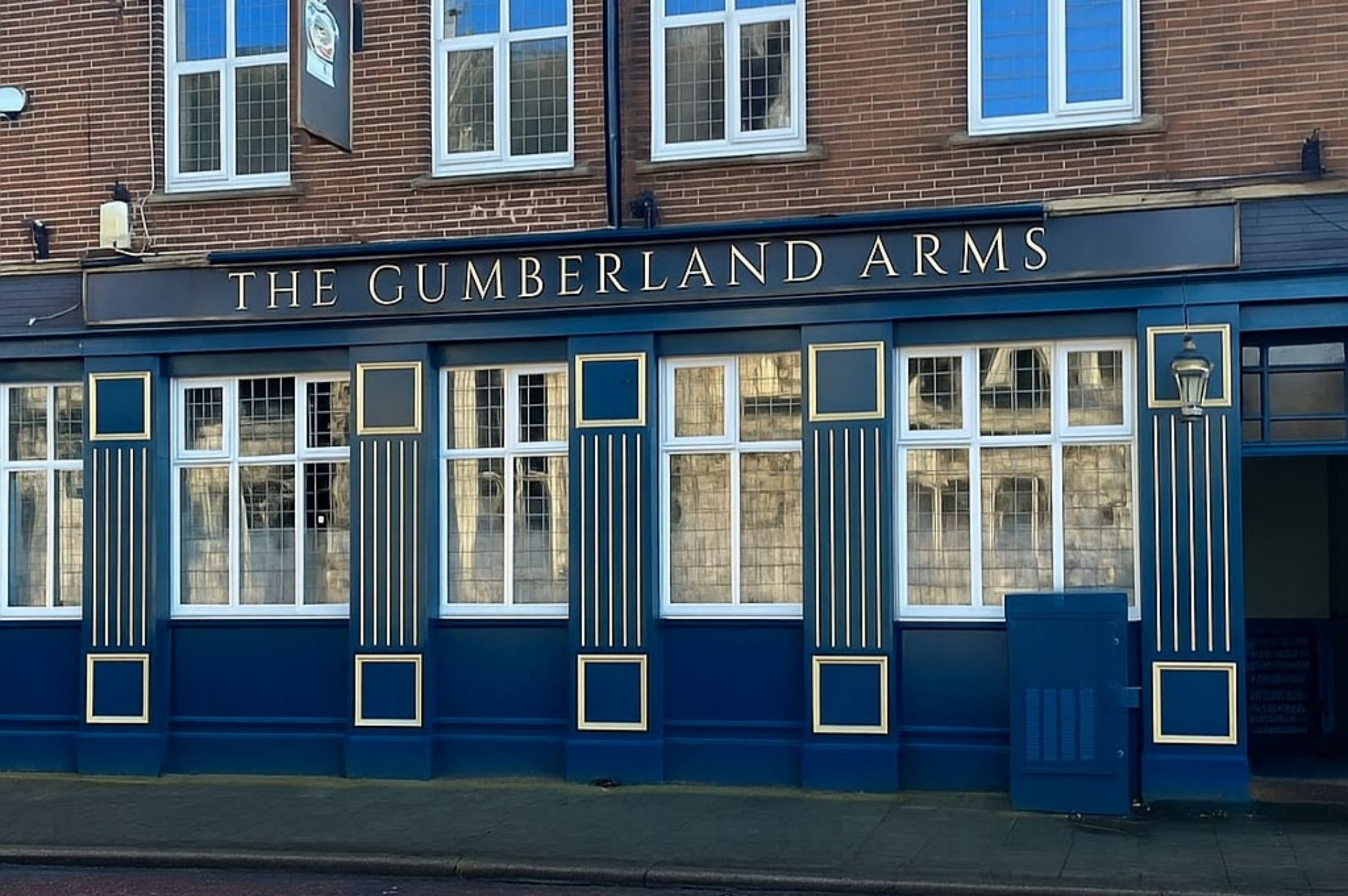
● The Cumberland Arms, Newgate Street, Bishop Auckland, DL14 7EN ●