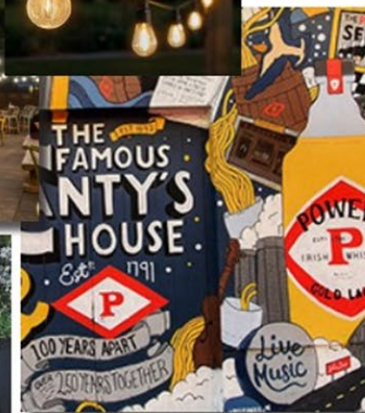
General feel - mural style