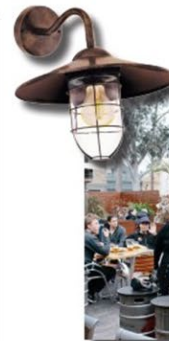
New wall lights