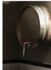
New mirrors in gents