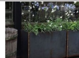
New external planting