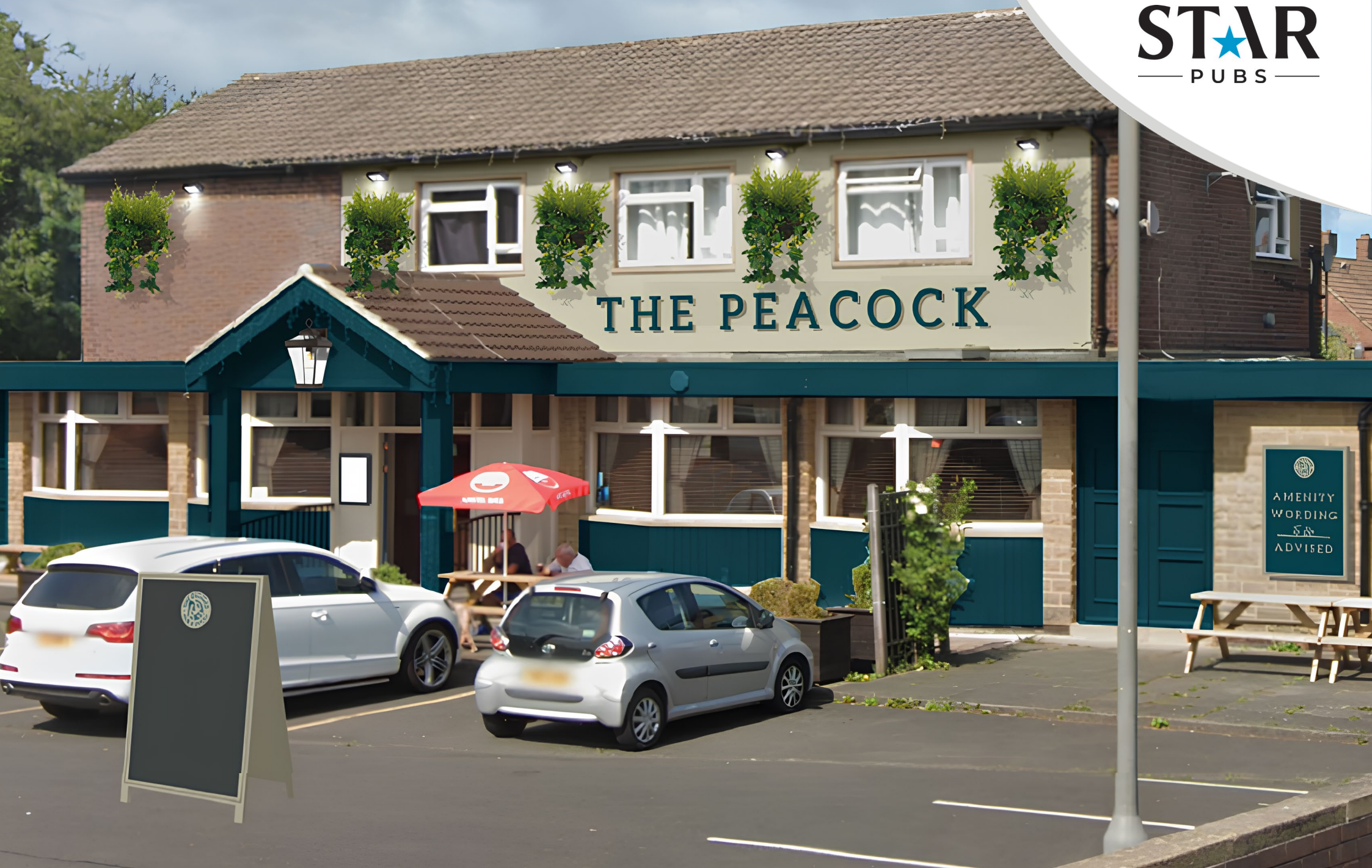
● The Peacock, Arlington Avenue, Kenton, Newcastle Upon Tyne, NE3 4TS ●