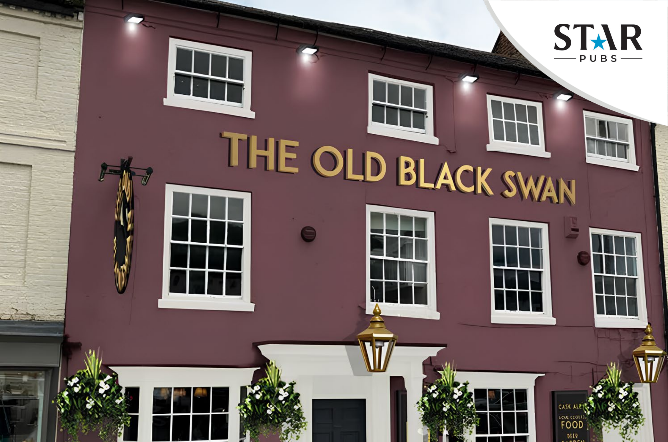
● Old Black Swan, 19 Market Place, Bedale, DL8 1ED ●