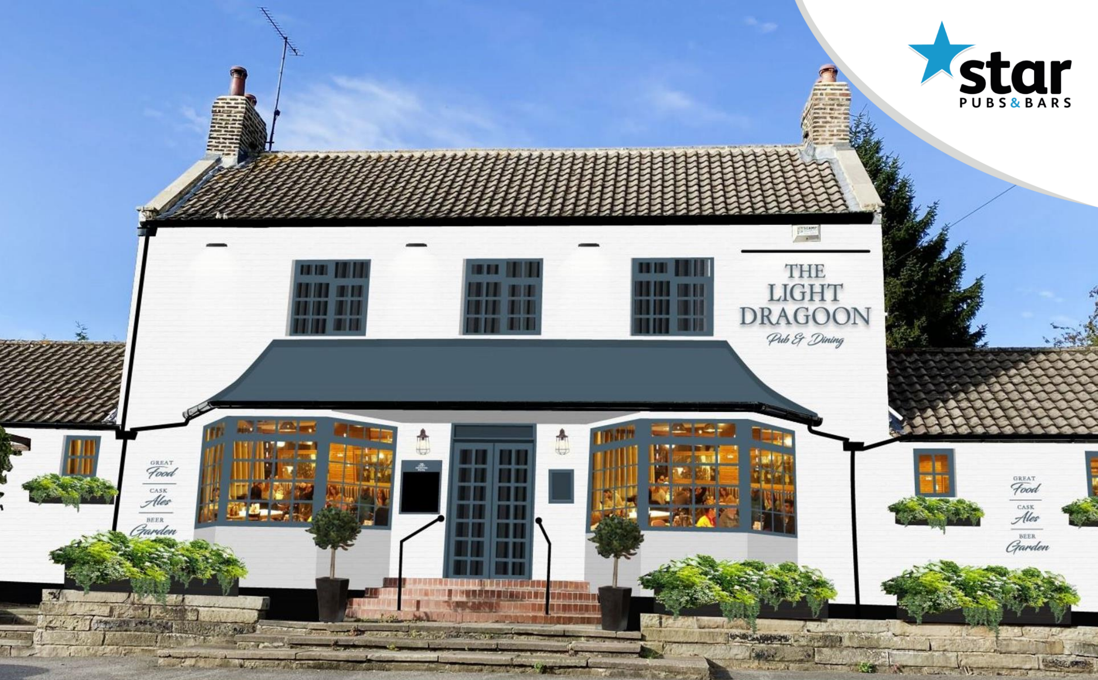
Light Dragoon, Etton, Beverley, HU17 7PQ