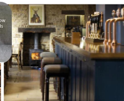
Repaint bar front midnight blue