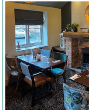
Clean existing carpet