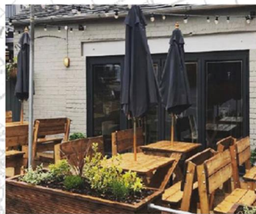
Robust picnic tables