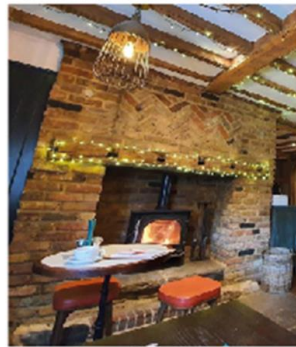
Dress existing fireplace