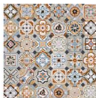
Industrial clean existing floor tiles