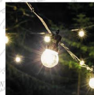
Festoon lighting hung on posts