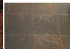
Clean & seal slate floor