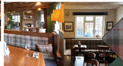
Industrial clean existing fixed seating