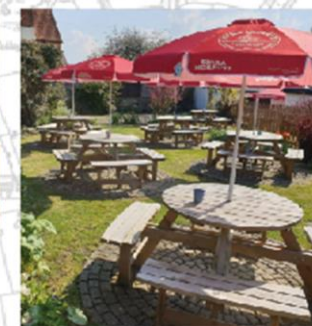
Picnic benches & branded brollies on grass