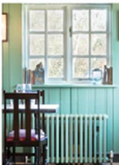
Bright painted radiators