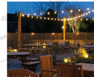
Teak furniture on patio