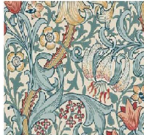
Morris & Co wallpaper