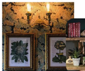
Reuse existing bric a brac, add new quality items