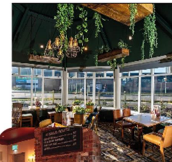
Clean existing upholsteries