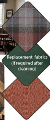
Replacement fabrics (if required after cleaning)