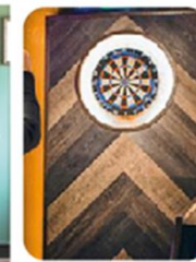
Reclaimed plank boarding to darts throw