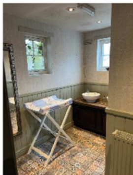
Redecorate existing toilets