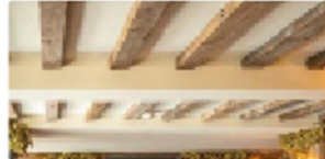
Paint ceiling beams in heritage tones