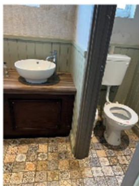
Dark painted cubicle doors