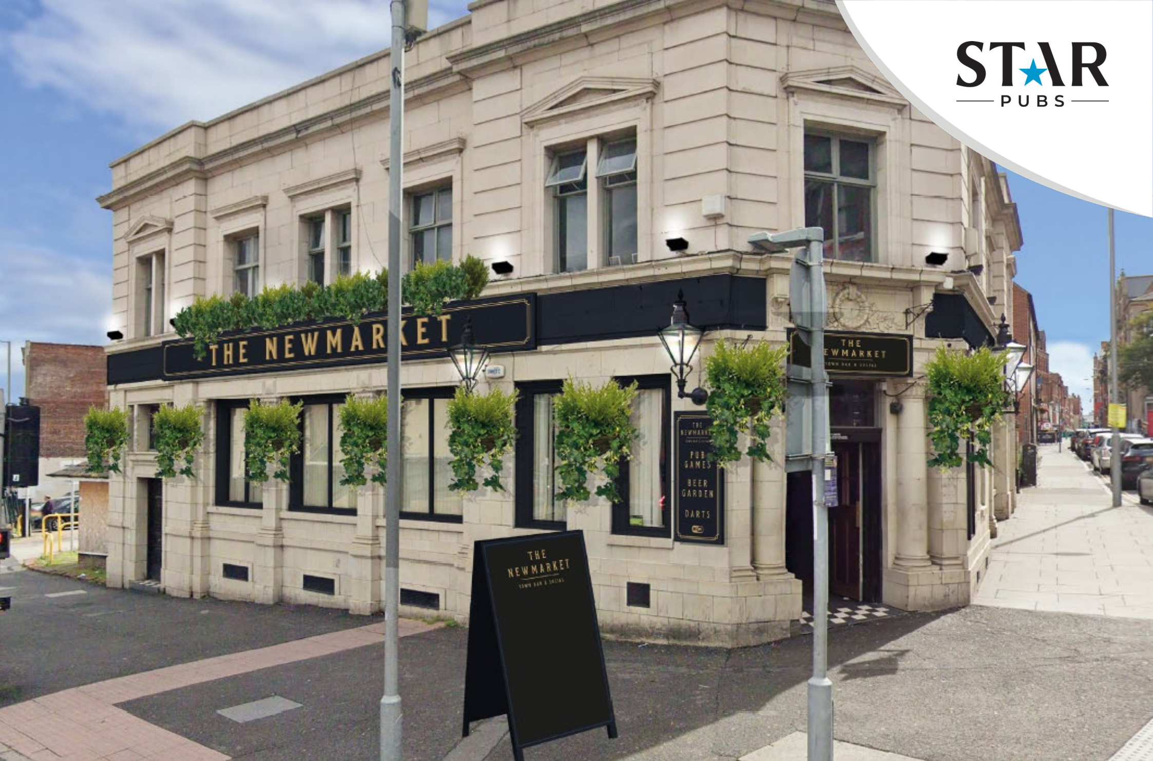
● The Newmarket, Lower Parliament St, Nottingham, NG1 3BA ●