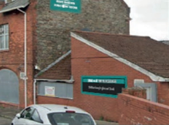
RIGHT HAND GABLE