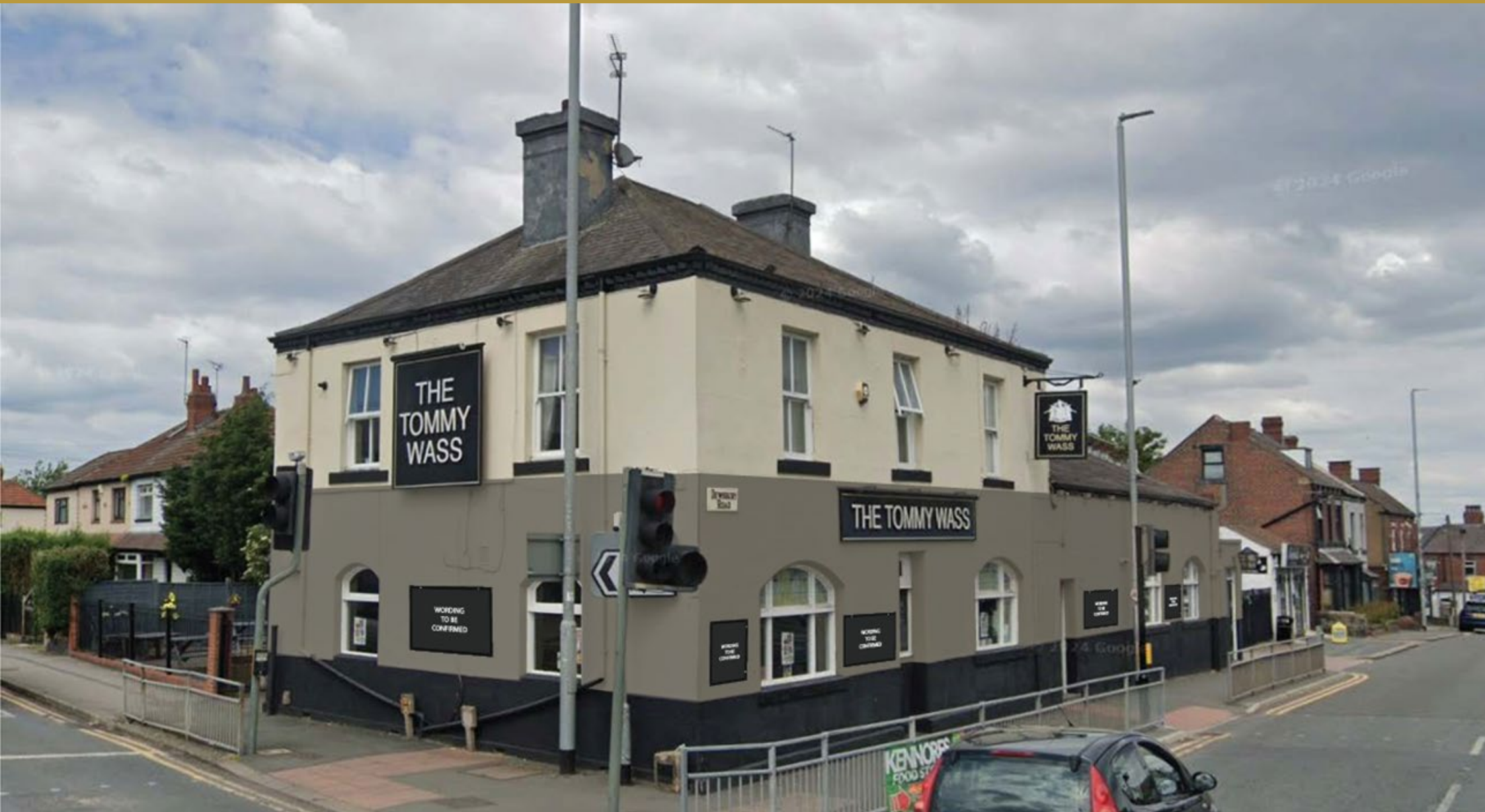
The Tommy Wass, 450 Dewbury Road, Leeds, LS11 7LJ