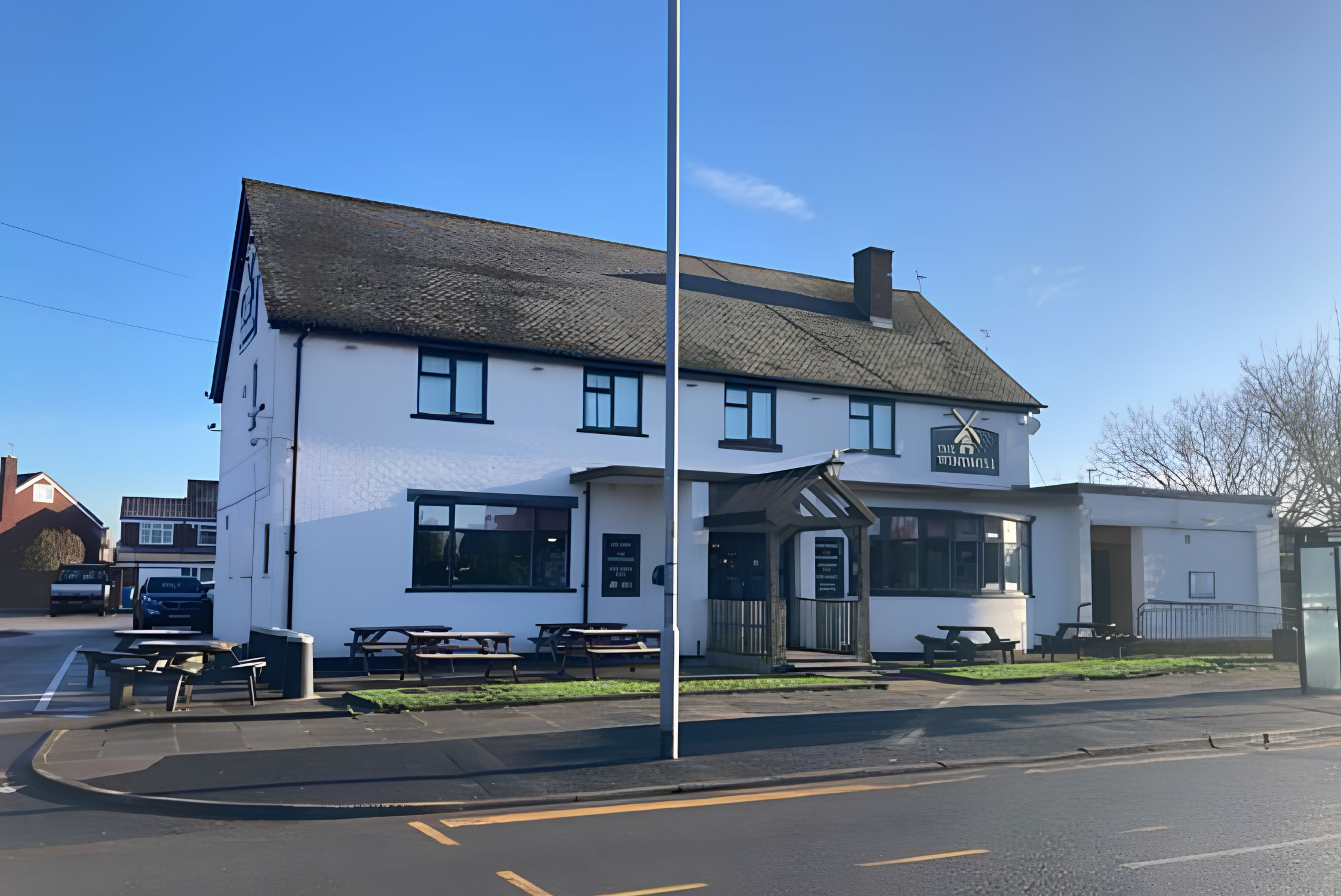
The King's Arms, 9 Bolton Road, Silsden, BD20 0JY