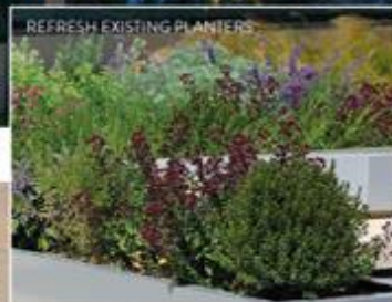
REFRESH EXISTING PLANTERS