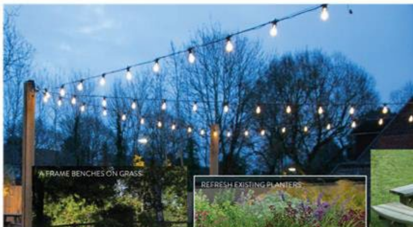
NEW FESTOON TO POSTS