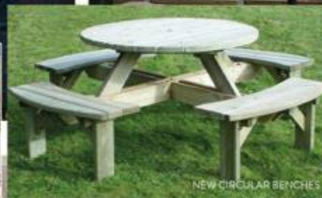
NEW CIRCULAR BENCHES