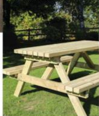
A FRAME BENCHES ON GRASS