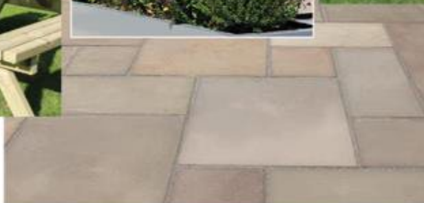
EXISTING PAVING RETAINED