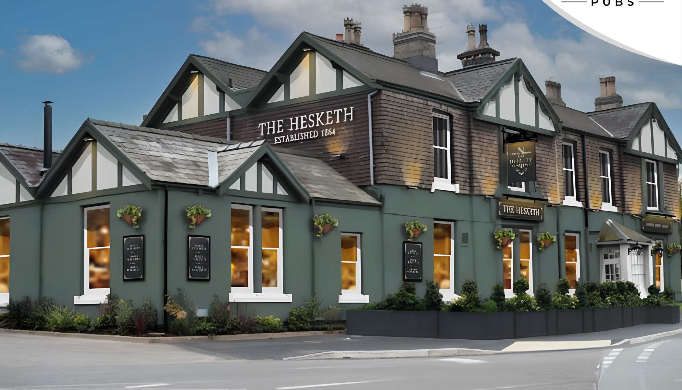
● The Hesketh, 63 Hulme Hall Road, Stockport, SK8 6JZ ●