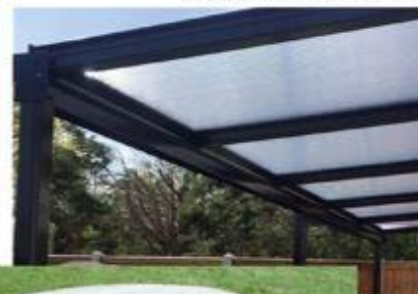
NEW POLYCARB ROOF TO SHELTER