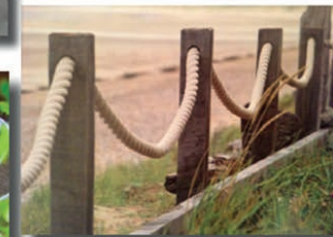
Post and rope