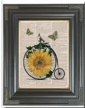
Bric a Brac