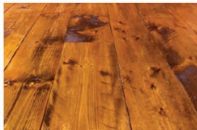
Existing Timber Floor Polished