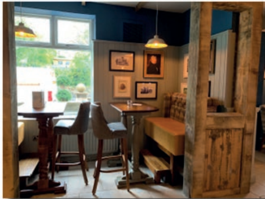
Main Entrance & Locals Bar