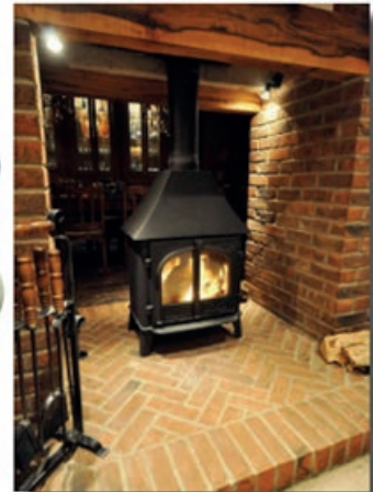
Through Fire to Extension