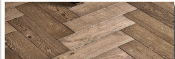
LVT Parquet Floor