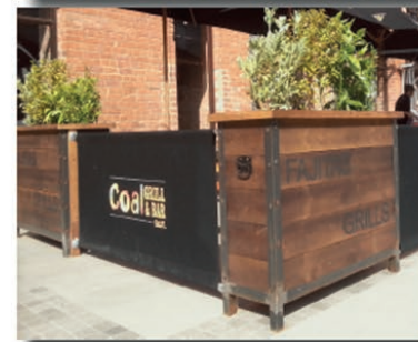
Branded planters & screens