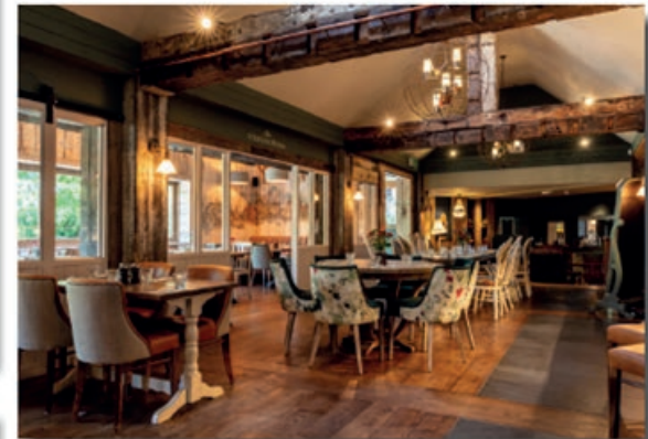
Dining Area Extension