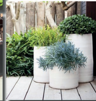
Free standing planters