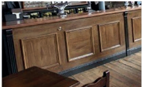
Polish Existing Bar Front