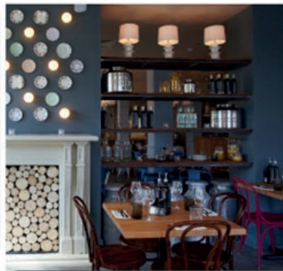
Through Display Shelves