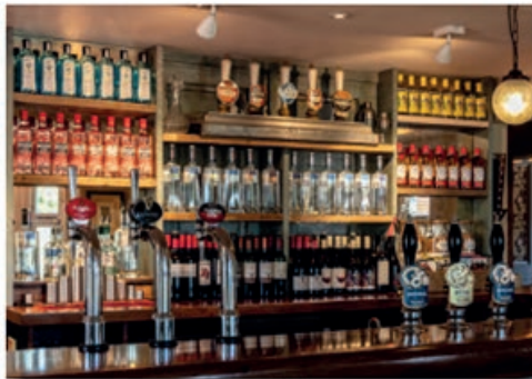
Back Bar Style