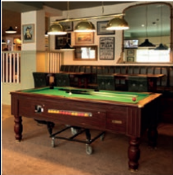
Pool Table/ Sports Area to Remain