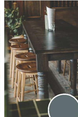
HIGH LEVEL TABLES TO THE BAR AREA