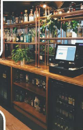
METAL BACK BAR