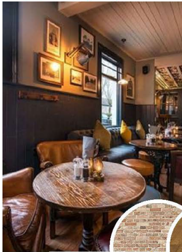
BRICK SLIP FEATURE WALL