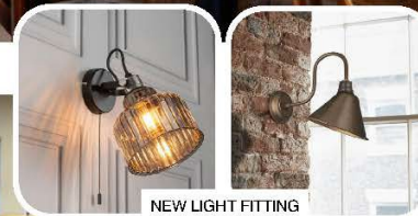
NEW LIGHT FITTING