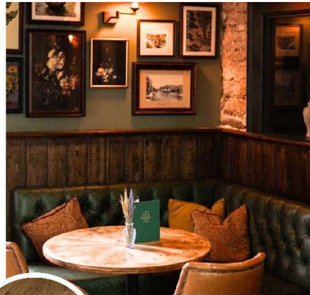
ENGINEERED OAK FLOORING