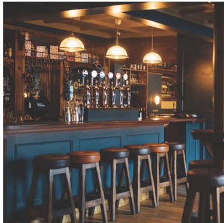
NEW BAR FRONTAGE