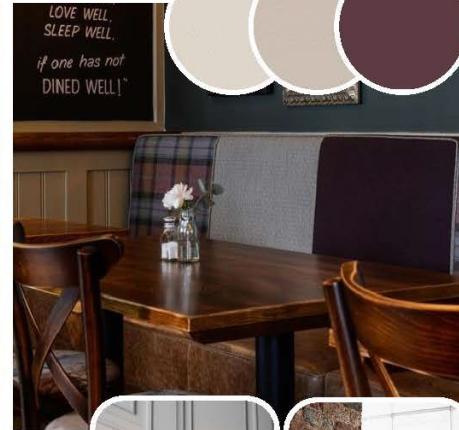
FURNITURE TO THE DINING AREA