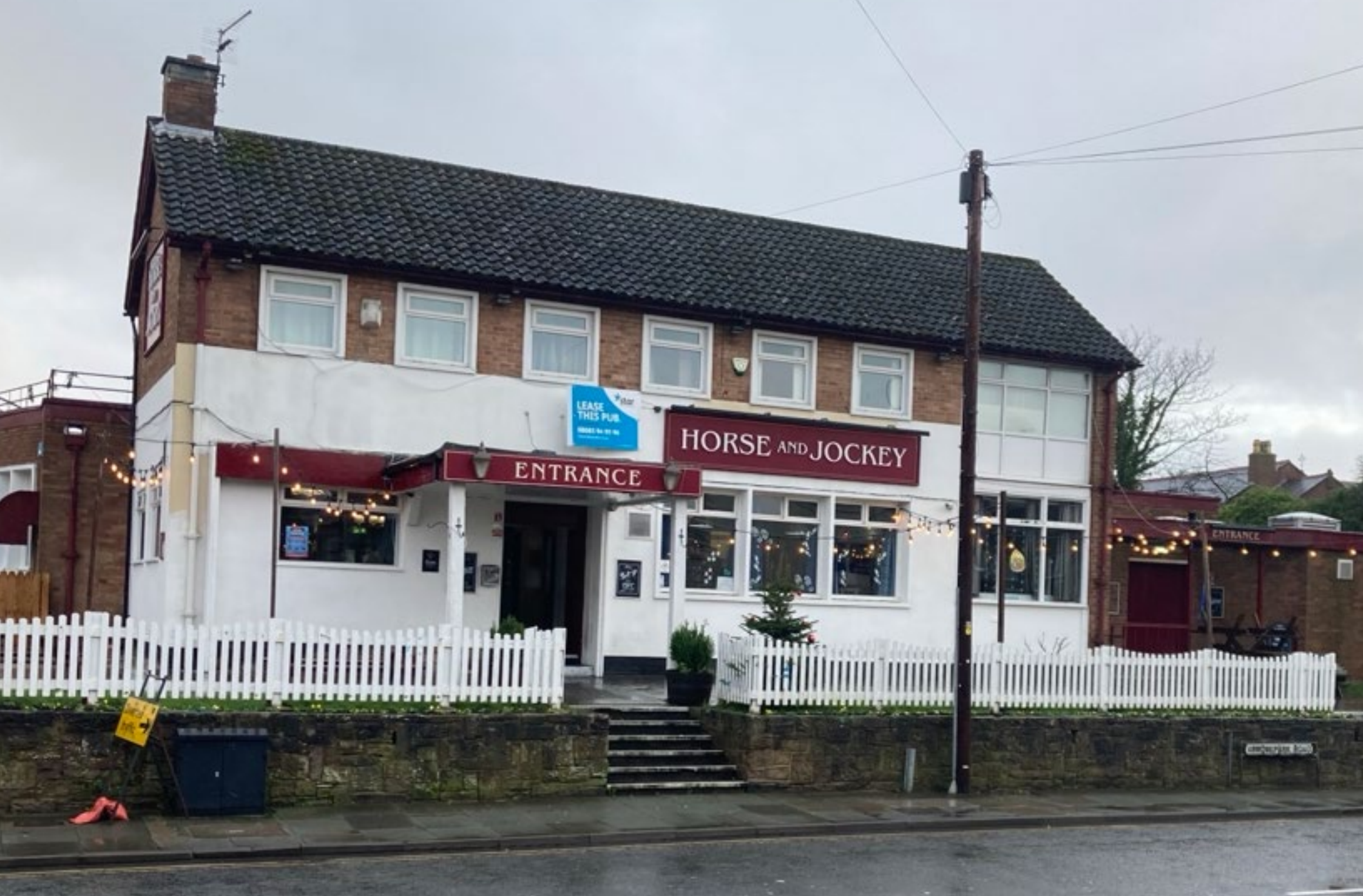
Arrowe Park Road, Upton Wirral, CH49 0UD