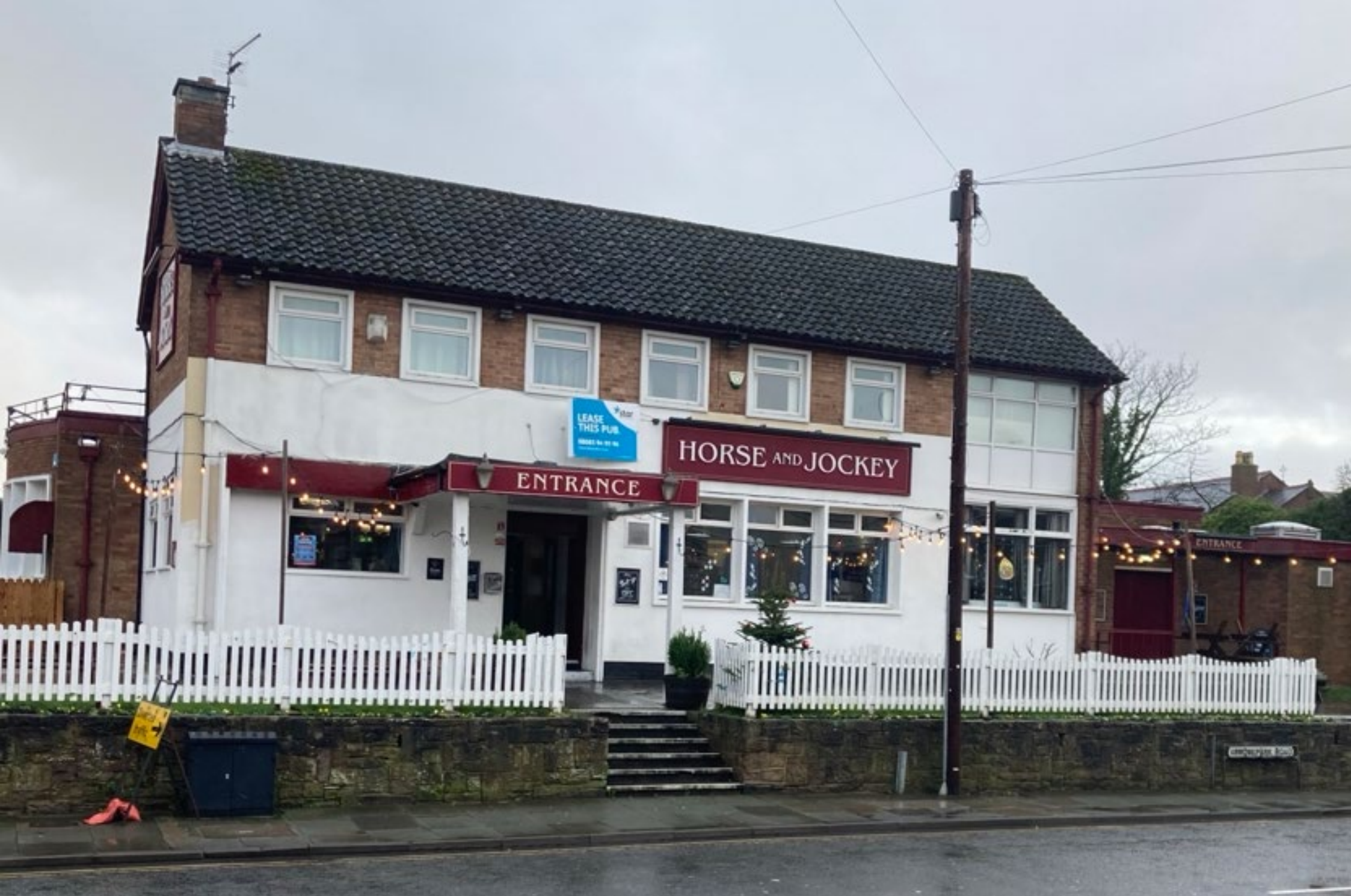
Arroe Park Road, Upton Wirral, CH49 0UD